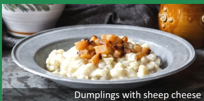
Dumplings with sheep cheese