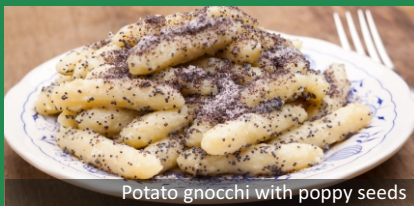
Potato gnocchi with poppy seeds