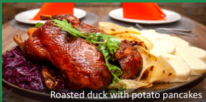
Roasted duck with potato pancakes