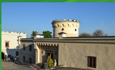
the Diocesan Museum of the Nitra Diocese