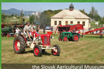
the Slovak Agricultural Museum

ERASMUS+ 2021-1-ES01-KA220-SCH-000029752 STEAMAction for the Future