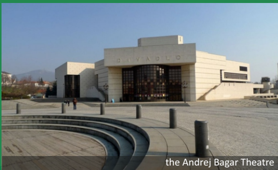
the Andrej Bagar Theatre

There are two theatres, museums, galleries and concert hall in Nitra: the Andrej Bagar Theatre and the Old Theatre of Karol Spišák. The Nitra Amphitheater is one of the largest in Slovakia.